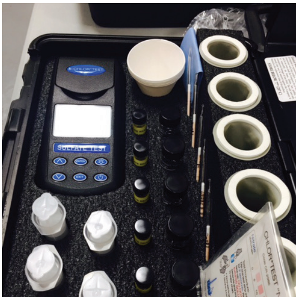
All components are pre-measured and pre-dosed for accuracy.

Quantitative results are achieved in minutes. Each kit contains (5) individual tests with new refill kits available.